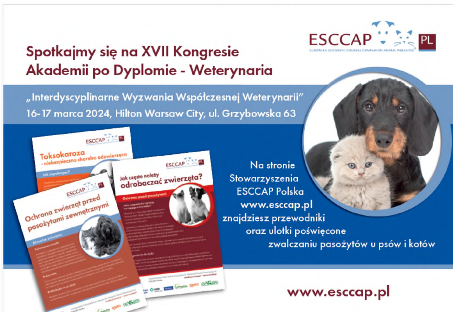
An advert for ESCCAP Poland in the congress special issue of the Veterinary Magazine

An advert for ESCCAP Poland also featured in the congress special issue of the Veterinary Magazine.