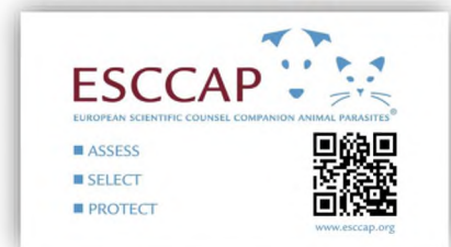
ESCCAP PowerPoint slide

A PowerPoint slide and poster, containing a QR code, have been added to the ESCCAP website as part of a promotional toolkit. The resources can be accessed from the About menu and used in presentations and campaigns to help deliver ESCCAP's key message.