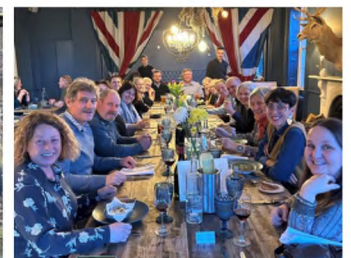
Sponsors’ meal, Tuesday 9th April 2024