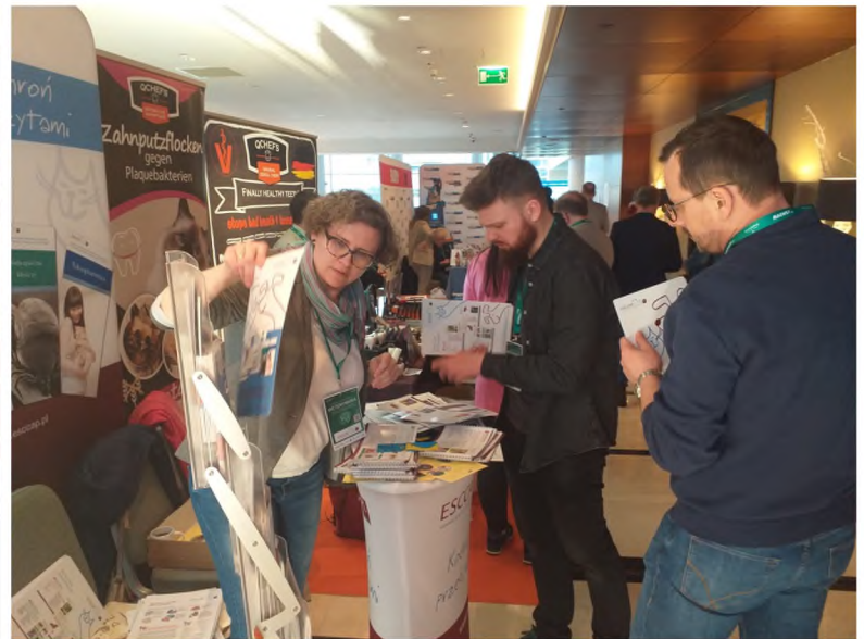
The ESCCAP Poland stand at the veterinary congress in Warsaw