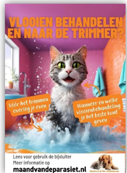
Month of the Parasite A3 campaign posters