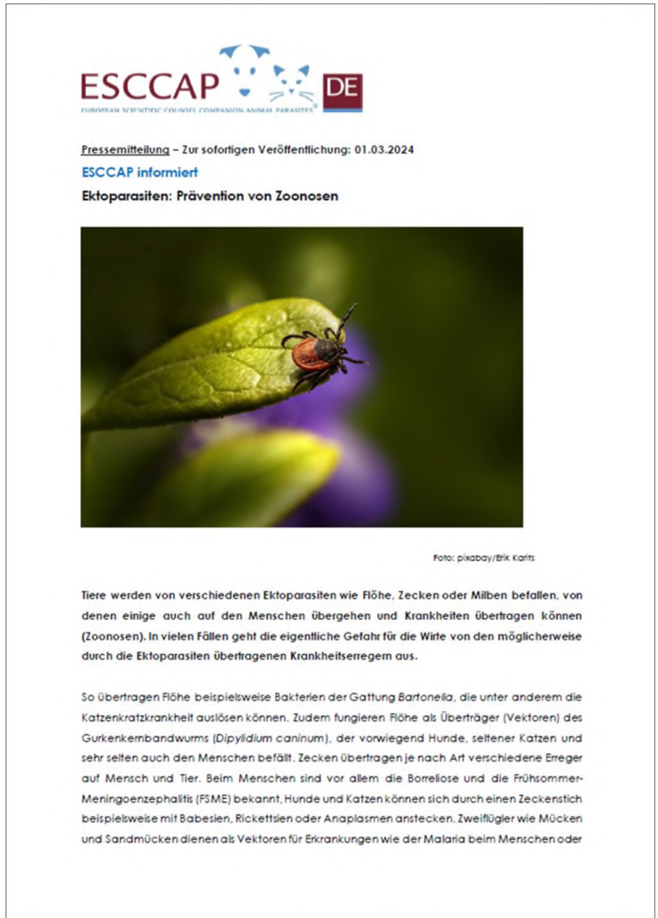
Ectoparasites: Prevention of zoonoses press release