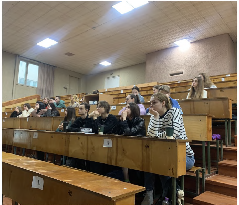
Students at the Stepan Gzhycky National University of Veterinary and Biotechnologies in Lviv, Ukraine

They were informed about the resources available on the organisation's website, particularly in the recommendations section where thematic guidelines on major