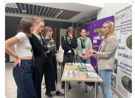
ESCCAP Poland in Krakow at a conference for vet students

great opportunity to spread the word about ESCCAP and to distribute its materials among students of the veterinary faculty.