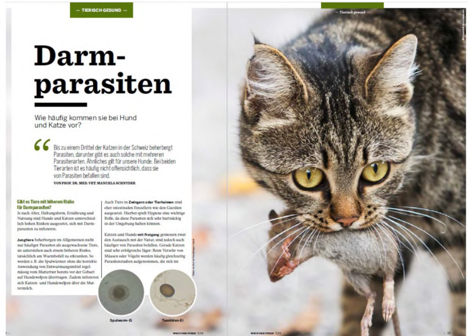
One of the magazine articles planned for 2024, authored by Manuela Schnyder

Media cooperation: In 2024, ESCCAP Switzerland board members have the opportunity to contribute towards media articles and feature in magazines and publications for pet owners and the broader public as shown in the table below.