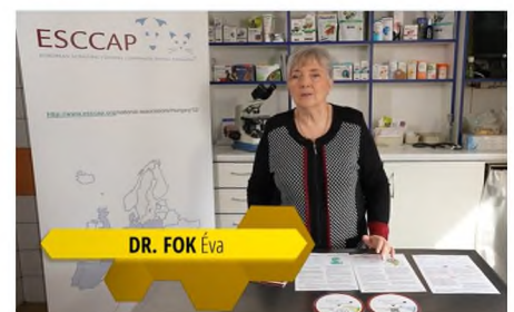
Video on the tapeworms of dogs and cats (excerpt taken from "Lifestyle Magazine")

( www.orionvet.hu , Vetoquinol) who supported this initiative. The videos can also be viewed via the ESCCAP Hungary website .