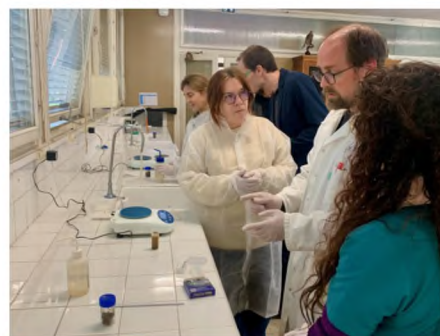
Workshop on coproscopy and the responsible use of anthelmintics in cats and dogs